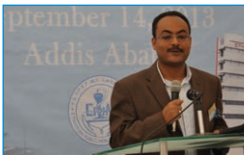
Dr Kesetebirhan Admassu

In fact, the first public speaking role I had in the Ministry of Health was at the annual conference of the Ethiopian Public Health Association held in Harar. EPHA is a proven partner to the government of Ethiopia. We have been undertaking a lot of projects together with EPHA.