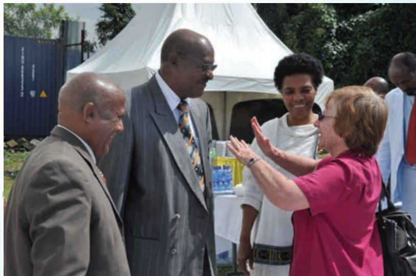
Representatives of WHO,EPHA, EHNRI and ASLM, who delivered speech during the HIV drug resistance strategy and protocol development workshop