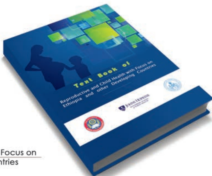
Reproductive and Child Health with Focus on Ethiopia and other Developing Countries

The agreement to produce this text book was signed between Johns Hopkins University Bloomberg School of Public Health and the Ethiopian Public Health Association in October 2012.