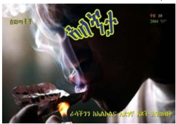
Picture -2 Special Youth Booklet Alegenta (48 pages) 20,000 copies are being printed

3. Print Materials Production: Leaflets - 100,000 copies- printed and were being distributed.